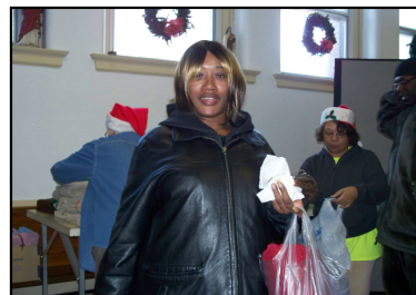
Thanks for the towels!