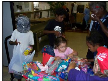
Back to School

We can never express our gratitude for the help we receive which allows us to do what we do. We hope all of your Holidays were blessed.