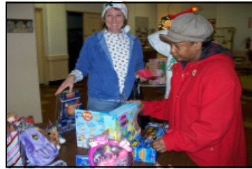
My daughter will love this!