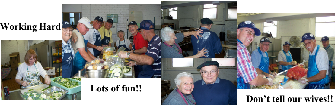
Lots of fun!!